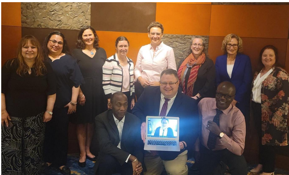
First in-person board meeting I attended, October 2021. The board had not met in person for 2 years.

I also faced many challenges. The global economy and the effects of the pandemic impacted us all: individuals and organizations alike. We faced illness and felt vulnerable. We experienced vaccine inequities and felt helpless. We cried and laughed.